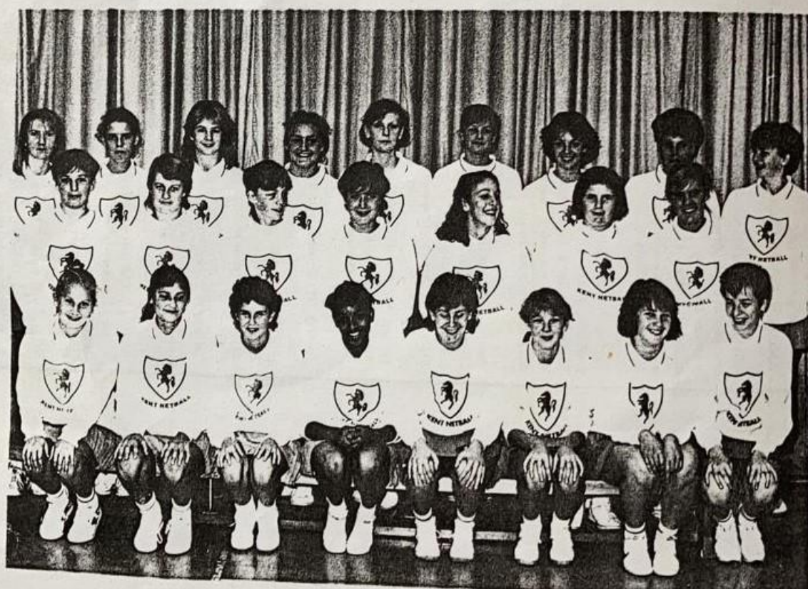
KENT SCHOOLS U16 SQUAD 1986/87

NATIONAL KENT NETBALL TOUR Sponsored by:- INTER (UK)