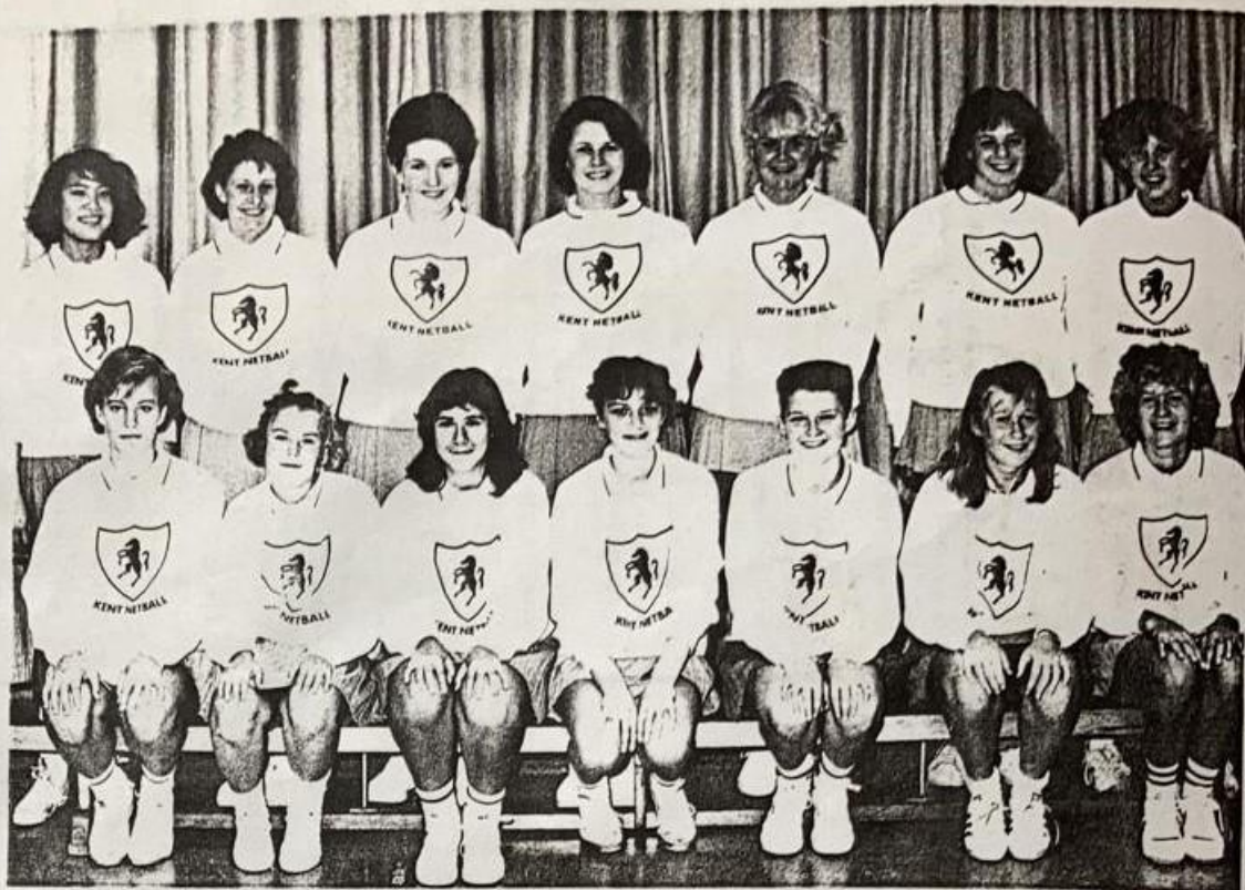
KENT SCHOOLS U18 SQUAD 1986/87